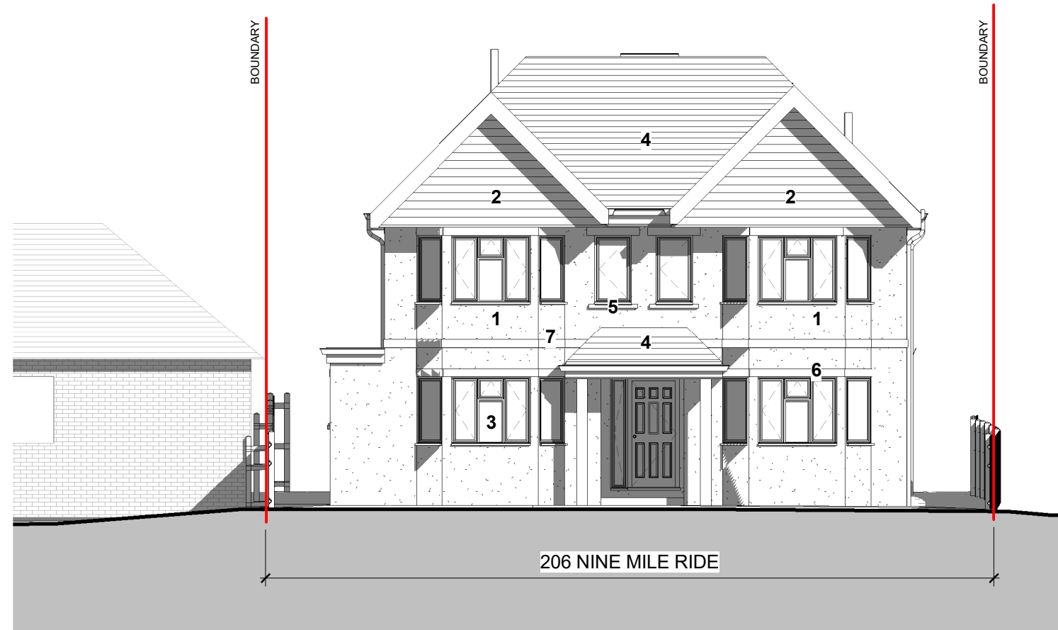
FRONT ELEVATION - NORTH